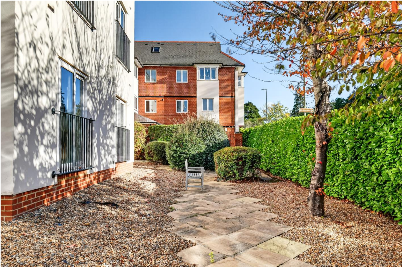
3 St Clements House, 33-45 Church Street, Walton-On-Thames, Surrey, KT12 2QN